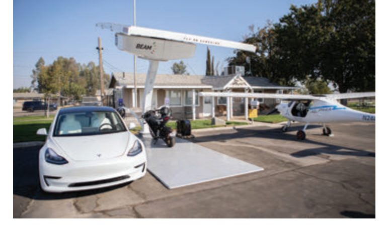
For more information about the New Technology Electric Air Plan Program, visit: HTTP://MEASUREC.COM/SUSTAINABLE-AVIATION-PROJECT/