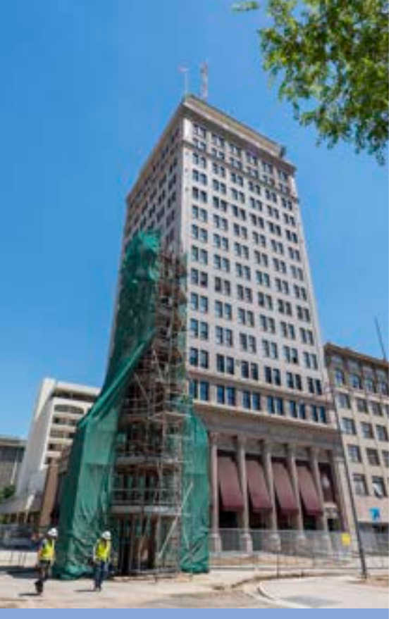
The Pacific Southwest Building, Fulton Mall